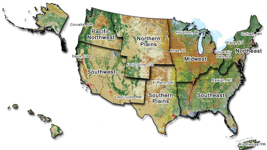
Fig. 1 The seven U.S. Department of Agriculture Climate Hub Regions, with subsidiary hubs located in Davis, California, Rio Piedras, Puerto Rico, and Houghton, Michigan. Hawaii and the USA-affiliated islands west are part of the Southwest Hub. Alaska is part of the Pacific Northwest Hub

In the USA, Cooperative Extension Service (CES) is often the primary source for agricultural information (Cash 2001). CES was created over 100 years ago to serve as the interface between land grant universities and stakeholders. While CES provides valuable support and information through county agents across the country, farmers in certain regions may be more likely to seek information from private agricultural advisors and consultants than CES (Prokopy et al. 2015). Since private agricultural advisors and consultants typically trust CES as a source of information and can also serve as a conduit of climate change information to farmers, foresters, and ranchers, CES is both an important user of weather and climate information and supporter of many weather and climate sensitive sectors (Brugger and Crimmins 2014). Whether CES works directly with farmers, foresters, and ranchers or through advisors, CES