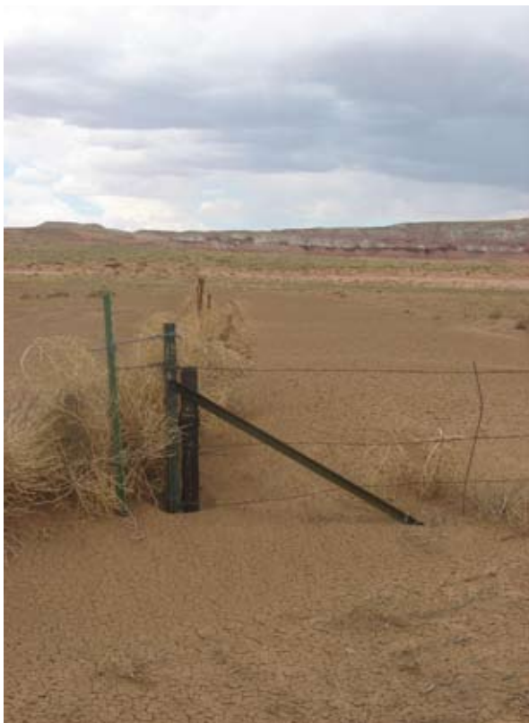
Figure 2. Rangeland across the Hopi Nation and Navajo Nation was heavily impacted by severe dust storms in April. Range conditions, already stressed by overgrazing and years of persistent drought, have been degrading rapidly in recent years.

These drought impacts are particularly surprising if you look at a current map of long-term precipitation deficits for