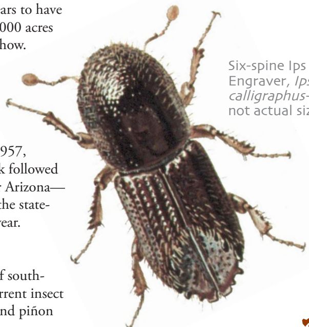
Six-spine Ips Engraver, Ips calligraphus —not actual size.